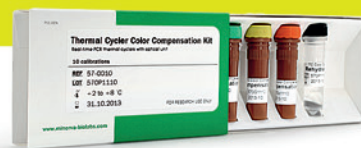
Thermal Cycler Color Compensation Kit