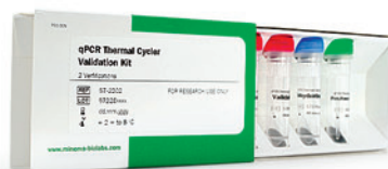
qPCR Thermal Cycler Validation Kit

Products for the control of microbials in cell cultures & water.