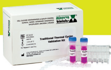
Traditional Thermal Cycler Validation Kit

Validation tools for testing PCR thermal cyclers according to legal requirements